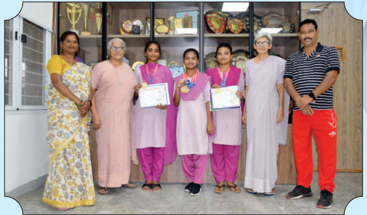
Champions in Sports