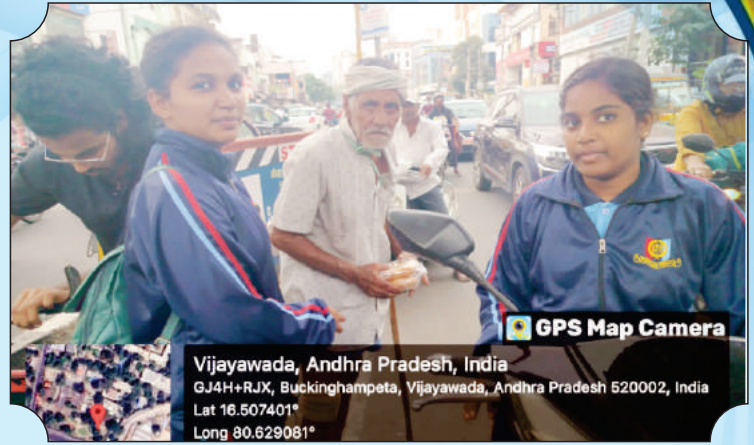
International Day of People with Disability