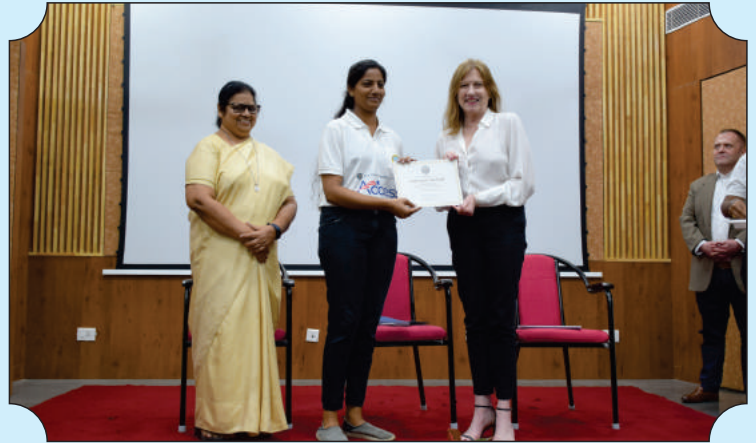
Receiving English Access Certificate