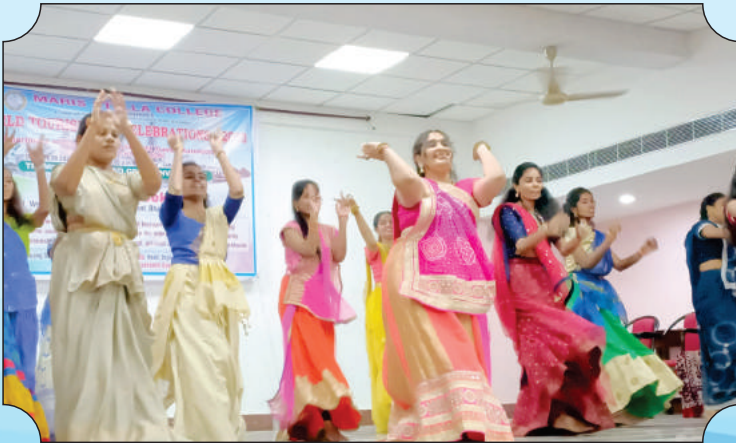
World Tourism Day