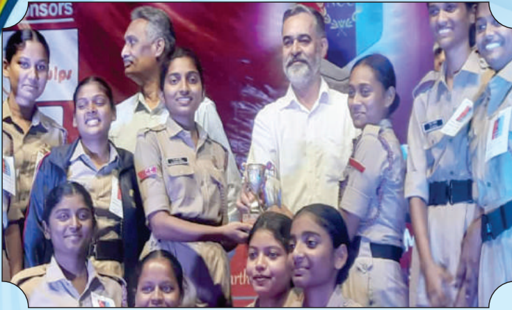
1st Prize in Drill Competition