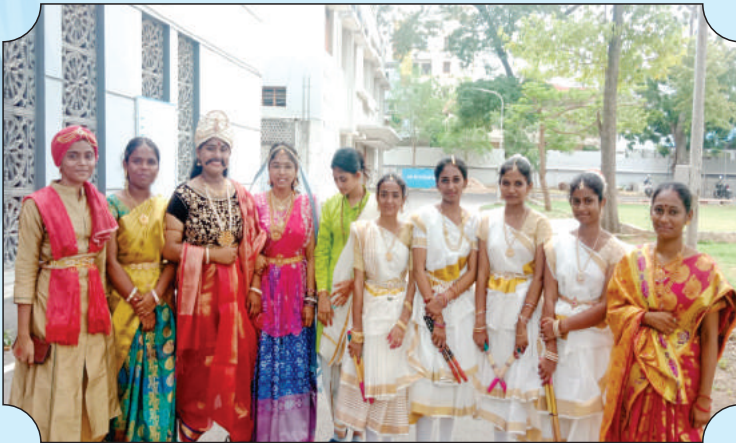
Telugu Bhasha Dinotsavam