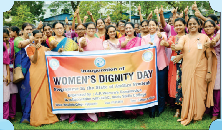
Women's Dignity Day