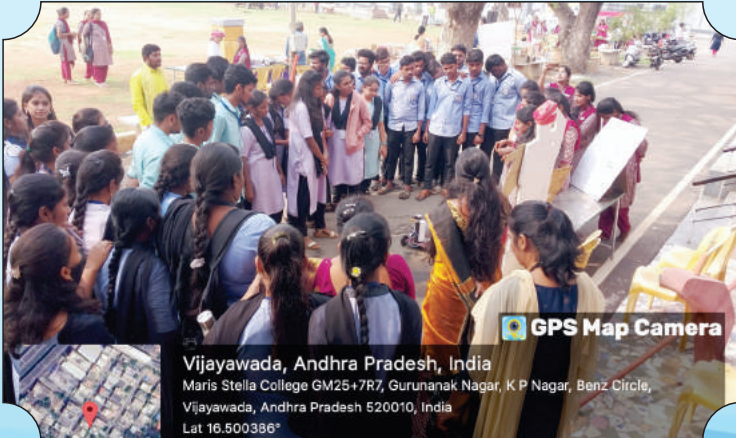
Smart Robotic Sprayer - Innovation of A & R Students