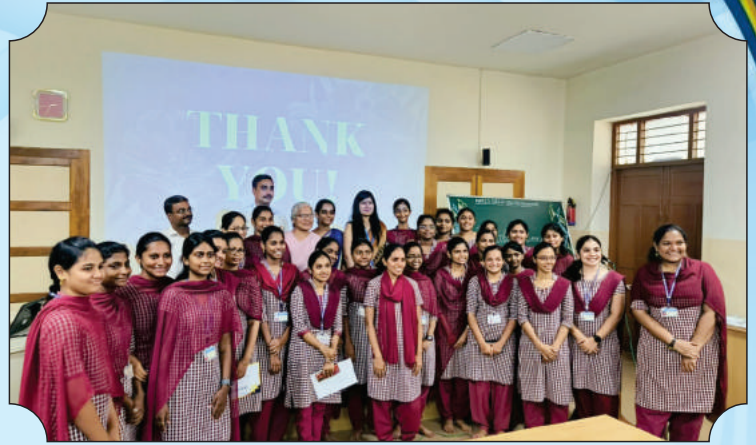
Bajaj Fin Serv Certificate Award