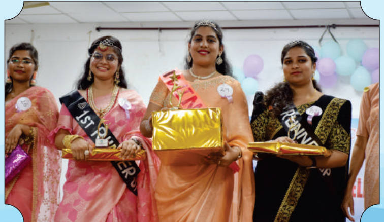
Winners of Miss Maris Stella