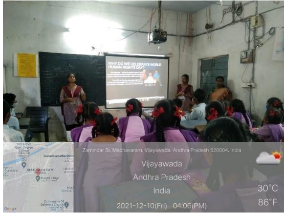
Overview of Human Rights PPT II B.A HEP & HELP students to 8 th & 9 th Class Students