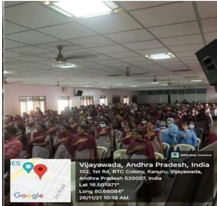
Taking Constitution Day Pledge by Students