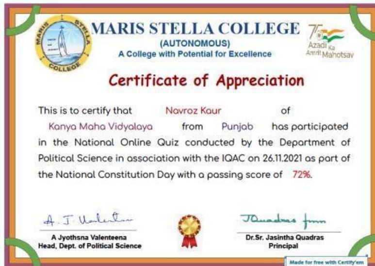
National Quiz E-certificate