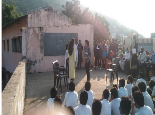
Skit on Human Rights by III B.A HEP & HELP Students