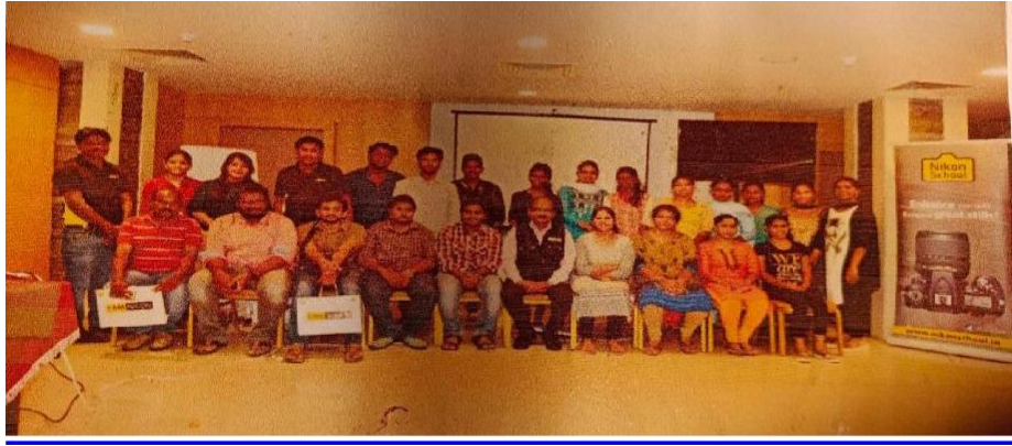
Students on the last day of the workshop