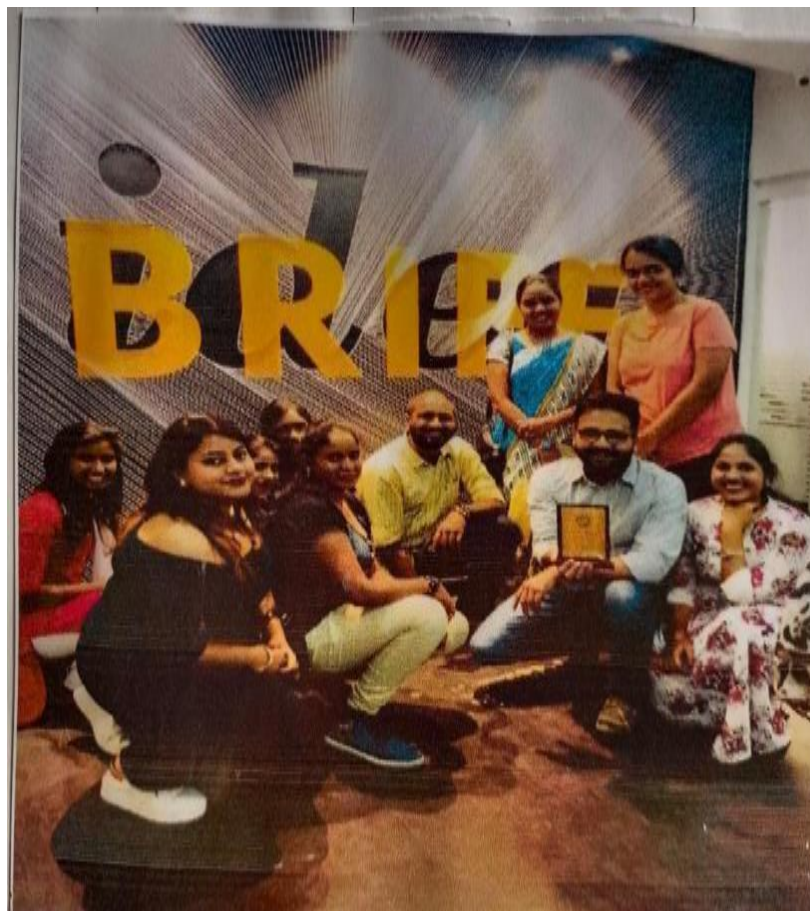
Students are all happy with their new learning. A guest lecture on “Introduction to newspaper design”