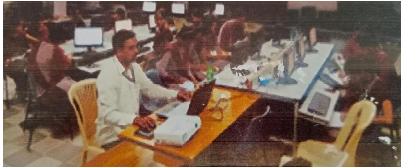
Practical training being imparted to the students A field visit to Chennai-based ad agency Banana Brandworks