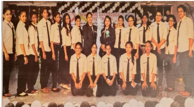
Students put their best foot forward in the student festival - “SHOWCASE 2K17” Photo Walk at Bhavani Island

Student festival - “SHOWCASE 2K17” Mirrors Creativity was held on September 15, 2017. Around 250 students participated in the festival.