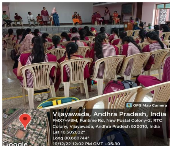
Spell Bee competition