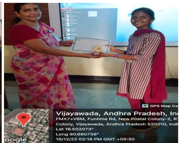
Prize distributions to the winners of the competitions 19.12.2022