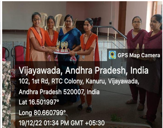
Prize distributions to the winners of the competitions 19.12.2022