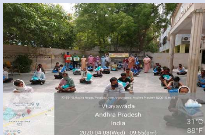
At Payakapuram Shelter Home

The main Rythu Bazaars (farmers' markets) have been split into smaller units by the municipal authorities to prevent crowding. One such unit is operating at Maris Stella campus to cater to the neighbourhood.