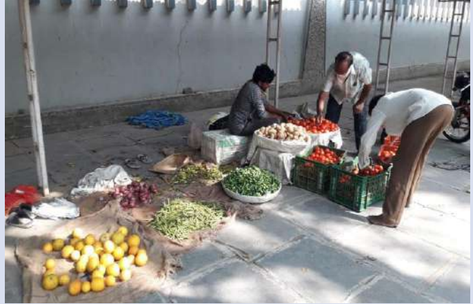
Sale of vegetables

Our indoor stadium was used for distribution of ration from the 15th to the 17th of April