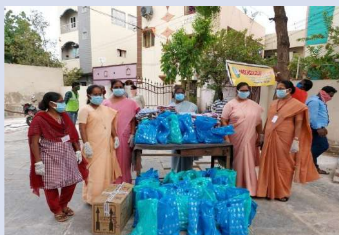
kits ready for distribution