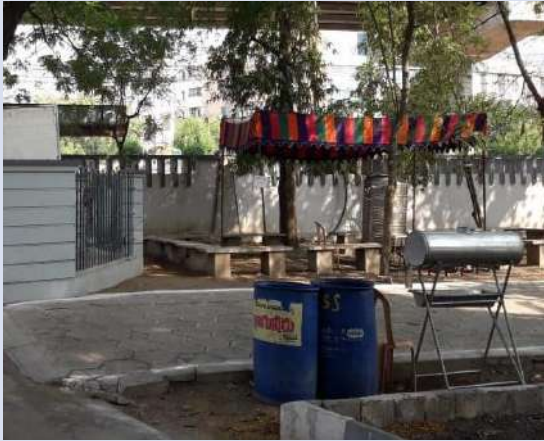
Awning readied for rythu bazaar