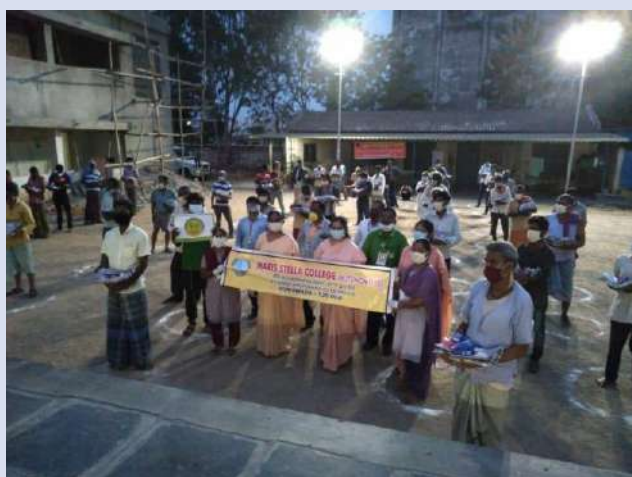
Shelter for migrant workers at Singh Nagar

On the 7 th and 8 th of April, representatives of college management, staff and students, with the support of the authorities, visited three shelter homes in Vijayawada to distribute kits comprising bedsheet, towel, toothpaste, soap, detergent and hair oil to migrant workers and needy persons housed there.