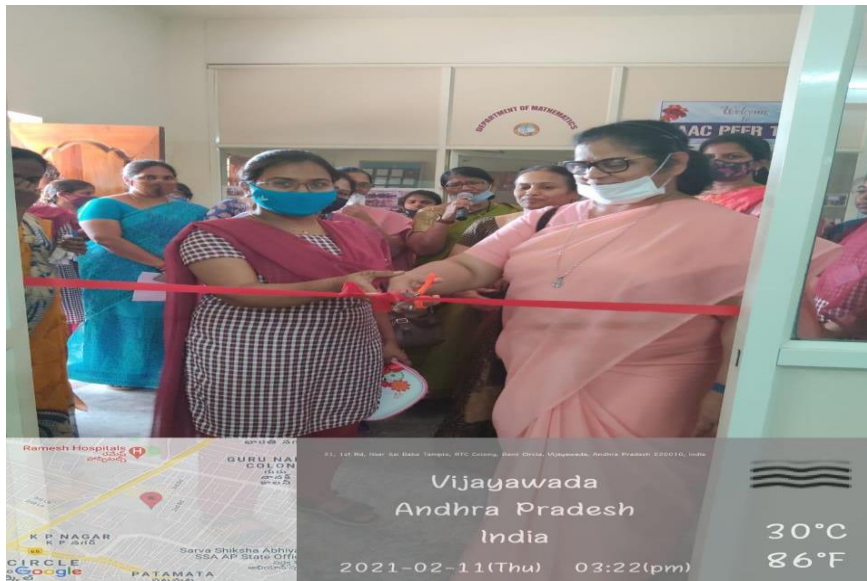
Principal inaugurating the stalls on 11-02-2021