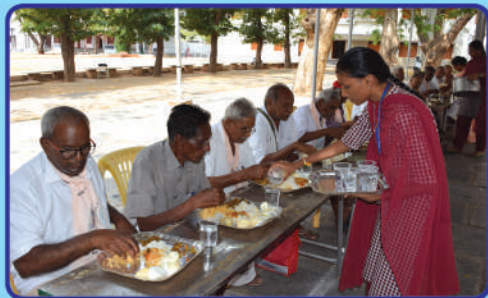
Service to the Poor