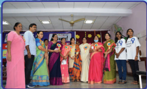
Anti Human Trafficking