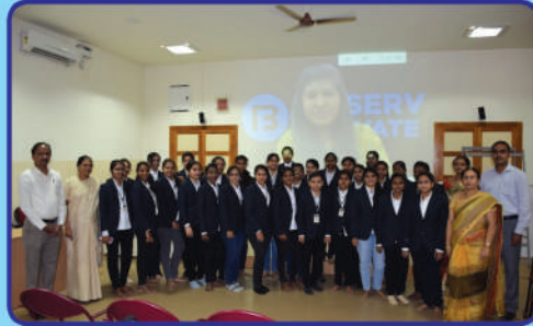
Bajaj Finserv Certificate