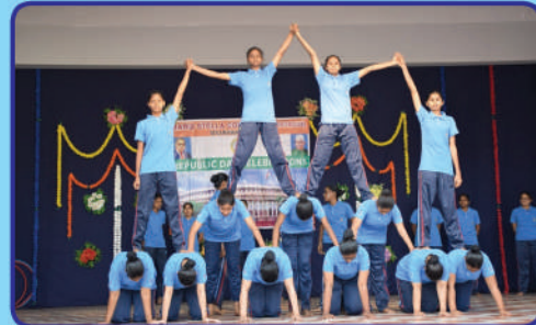
Pyramid by Students