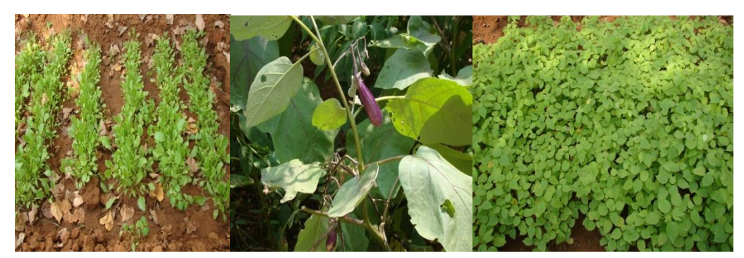
III B.Sc. Botany students attended a workshop on Horticulture& Microbial Techniques at Andhra Loyola College, Vijayawada 14.12.12.

Cultivation of vegetable yielding plants and leafy vegetables started in the Botanical Garden of our college from 11<sup>th</sup> October, 2012.