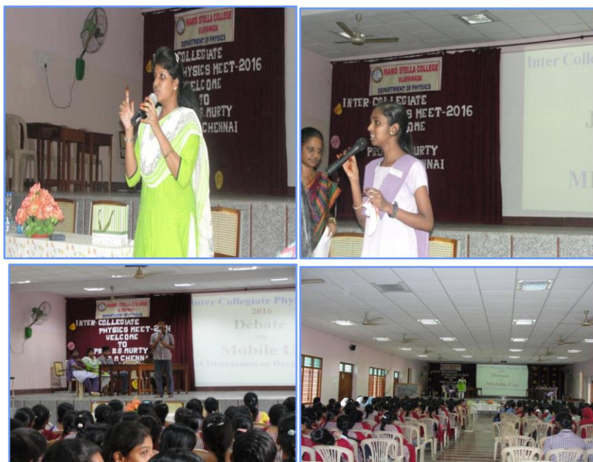
Just a minute talk on physics related topics on 23.07.2016

The campus was filled with vibrant energy and students actively participated and shared their creative ideas. The deliberations of the inter-collegiate seminar