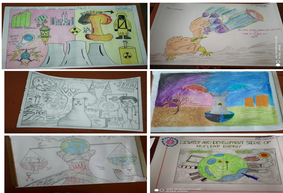
Prize winning charts of drawing competition on “Disaster and Development side of Nuclear energy”-23.07.2016