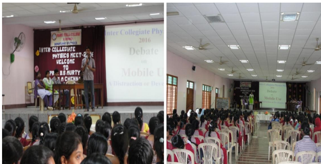
Debate on "Mobile Use: a distraction or development" on 27.07.2016

enlightened the students' community and motivated them and the various contests provided a channel to pour out their talents and refreshed the young minds.